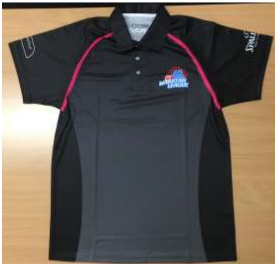
Referee Walk Out Shirts $43.70