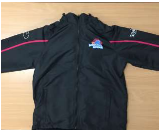
Referee Jackets $77.50