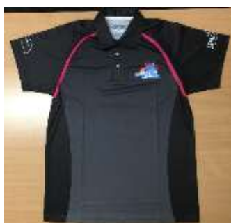
Referee Walkout Shirt

Remember you are not permitted to wear association and/or club attire.