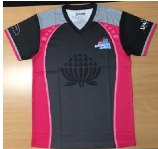
Junior Qualified Referee Shirts $43.70