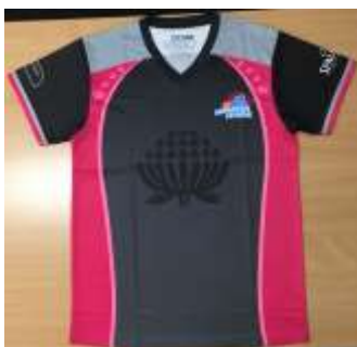
Junior League Referee Shirt